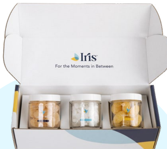
Provisions box features ginger buds, cool mints, and lemon drops

Through your health plan, your organization activates your Iris benefit and we take care of the rest. For your current employees with cancer and your newly diagnosed employees, the Iris team will send personalized invitations to introduce them to the Iris program. We also provide HR and benefits teams with an Iris handout you can provide to your employees who inform HR of their diagnosis.